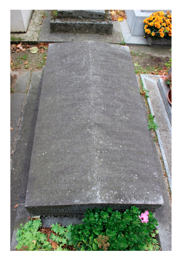
Figure 4. The tomb of the Broca Family in the Montparnasse Cemetery, Paris.

1861, he refused to reject Bouillaud's theory that both hemispheres were involved in articulatory language (Leblanc, 2017). It would take him four more years and sixteen more cases before he argued in favour of the left hemisphere in his fundamental publication entitled "On the Seat of Articulatory Language" (1865).