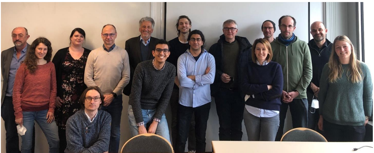
Members of the research unit SPATE at the SPATE-Meeting in Hannover, April 2022.